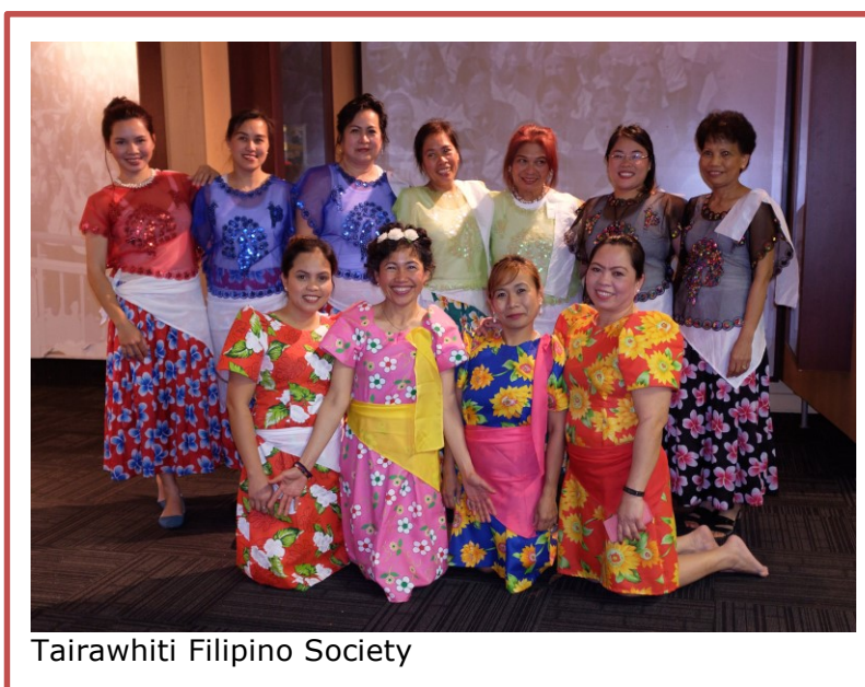
Tairawhiti Filipino Society

A hearty brunch at the White House for Sunday morning, with some dancing revision, and the FDNZ AGM, most competently kept concise, completed the schedule. It truly was a weekend of Rhythm and Grapevines.