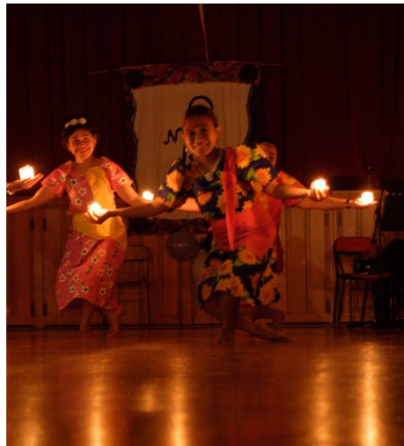
Tairawhiti Filipino Society candle dance